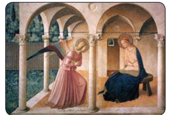
- Fra-Angelico 1438

Lady Day: Since medieval times, 25 March has been known as Lady Day, and for centuries it has been seen as very special. The name comes from the medieval Church's celebration of the Annunciation, which Christians believe was the moment the archangel Gabriel announced to Mary that she would bear a son. Once the Church had fixed the liturgical date of Christmas at 25 December, the Annunciation logically fell around 40 weeks earlier. Since the 7th century, it has been celebrated on 25 March.