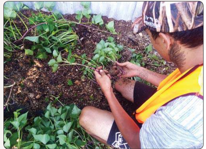
The PD Man shows us how to plant Kumera