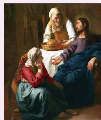
Johannes Vermeer 1654-5