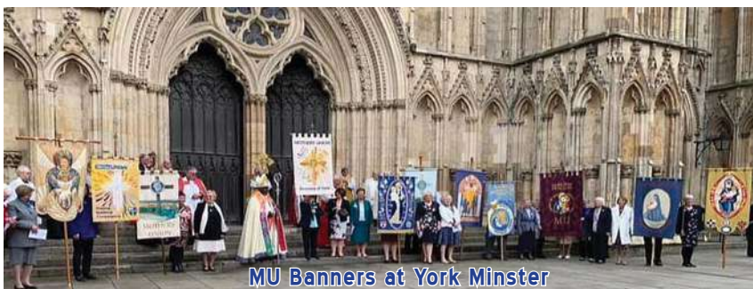
MU Banners at York Minster