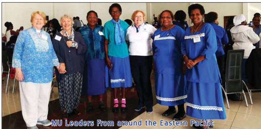
MU Leaders From around the Eastern Pacific