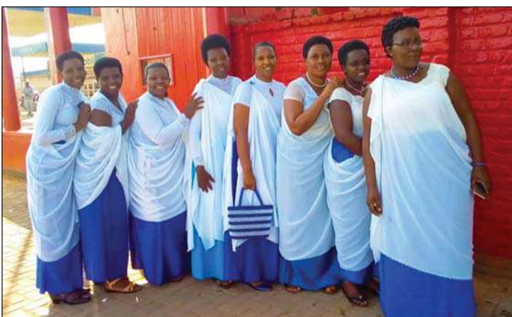
Women proudly wear the Mothers' Union Blue and White, the traditional MU Uniform colours at Kigali.