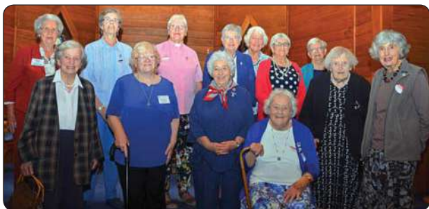
A group of Long-Term Members