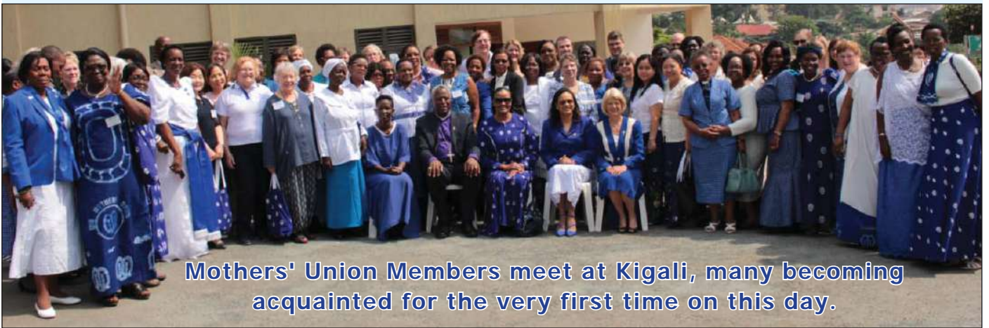
Mothers' Union Members meet at Kigali, many becoming acquainted for the very first time on this day.