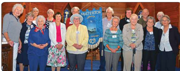
From Epiphany Church, Masterton